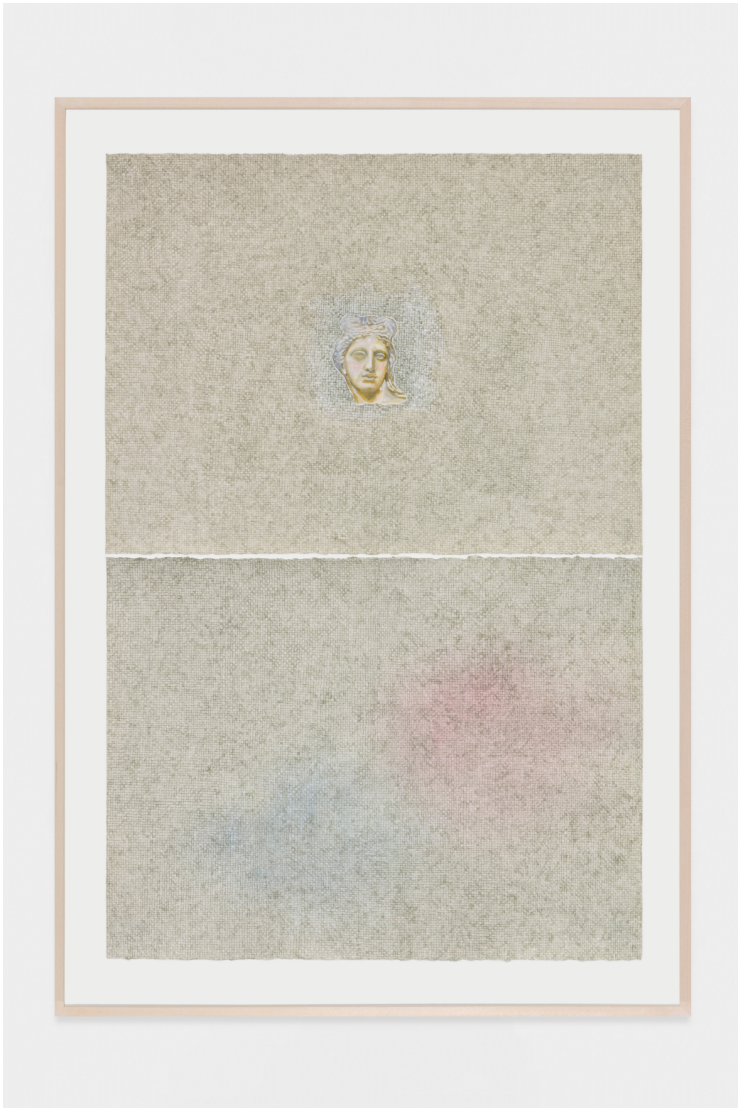
Paolo Colombo Blushing Aphrodite , 2021 Watercolor on Arches paper 49 1/4 × 34 1/4 × 1 5/8 in 125 × 87 × 4 cm